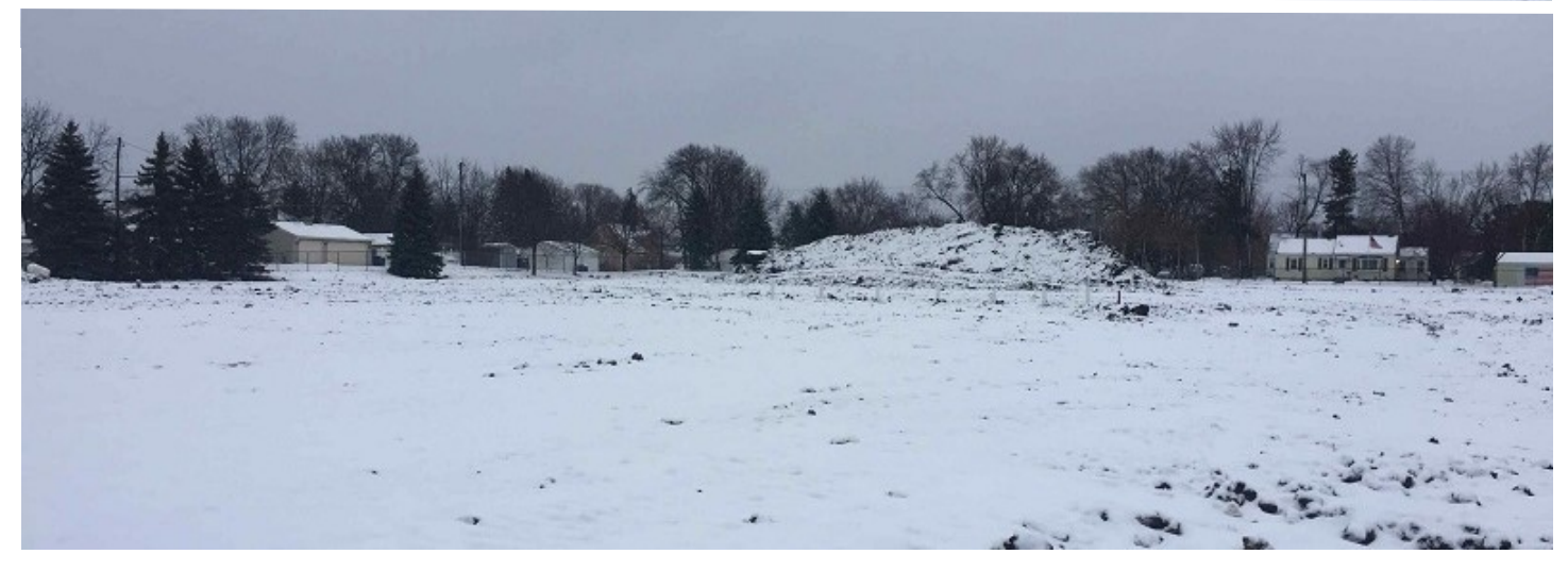
Images from top to bottom: View from southeast corner of site; heavy equipment leaving site; stormwater management system ports roughed-in; play field rough graded (January; no new photos this month)