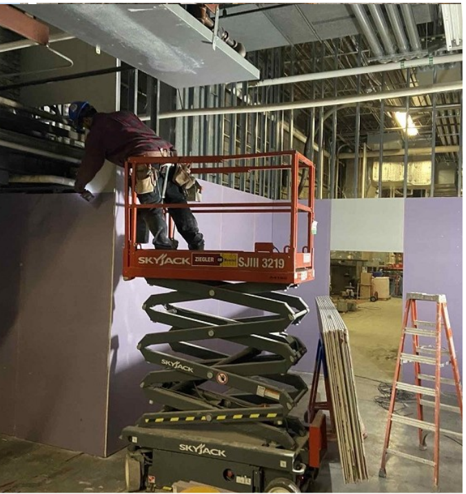
From top then left to right:

New exterior of addition; creating new doorways into an office area; putting a wall in place to create new breakroom corridor area; ductwork and curb supports on the roof (February)